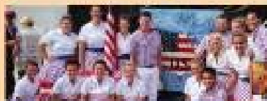
Balley Mt. Cloggers Wednesday- Saturday