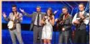
Mountain Faith Saturday & Sunday