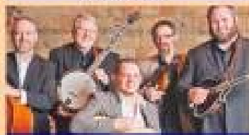
Balsam Range Friday