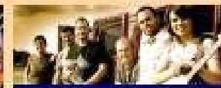
The Grascals Friday