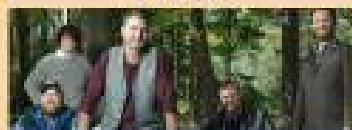
Volume Five Friday