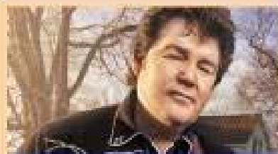
Marty Raybon Thursday