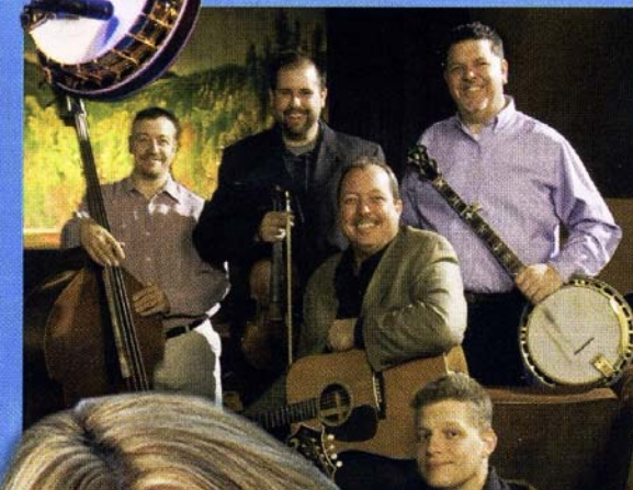
IIIIRD TYME OUT